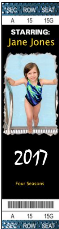
(5) Ticket Stubs