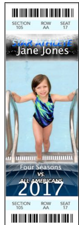
(4) Ticket Stub Magnets