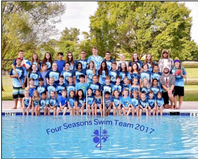
** (1) 8 x 10 Graphic Group Picture

THESE ARE JUST SOME OF SPORTS FAN & NOVELTY ITEM EXAMPLES Graphics may vary.