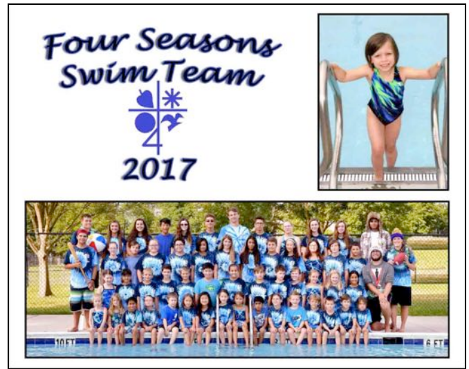
**Memory Mate: Team picture and individual picture on (1) 8 x 10 Photographic Sheet