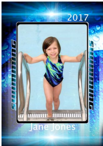
Trader Card Front