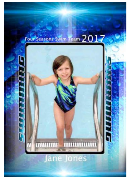
(2) 3.5x5 Magnets