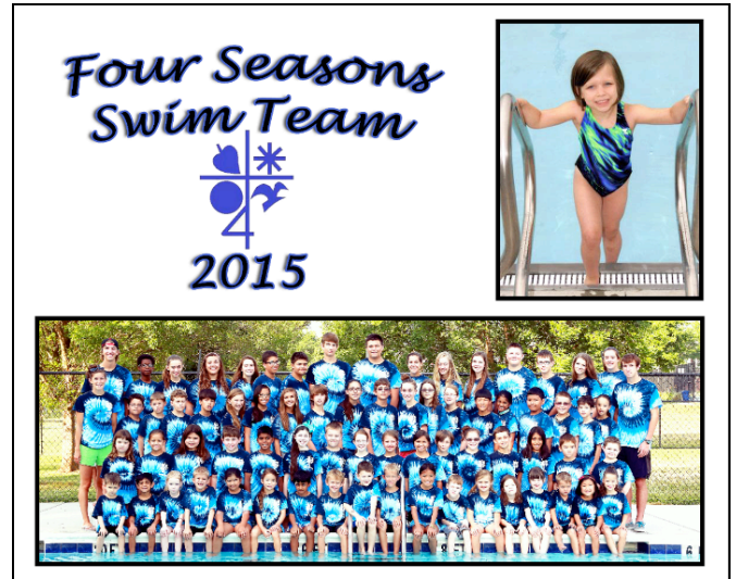
**Memory Mate: Team picture and individual picture on (1) 8 x 10 Photographic Sheet