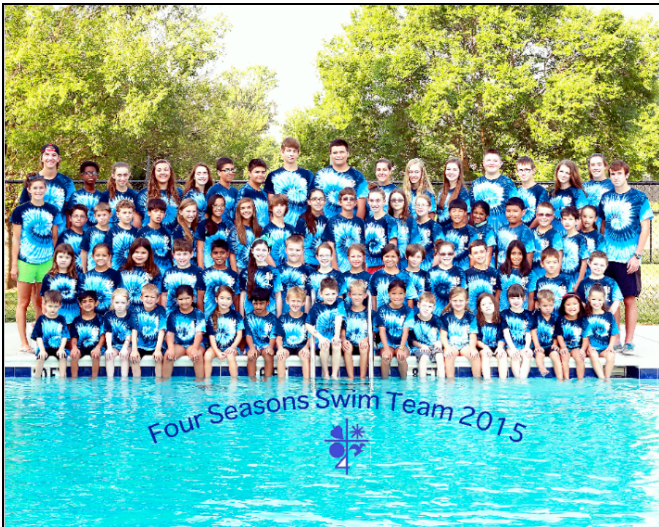
** (1) 8 x 10 Graphic Group Picture