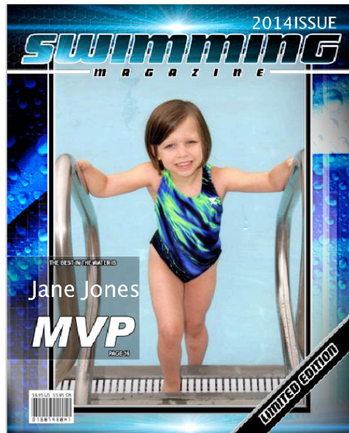
8"x10" Individual Magazine Cover w/name