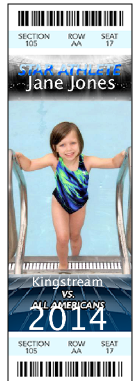
(4) Ticket Stub Magnets