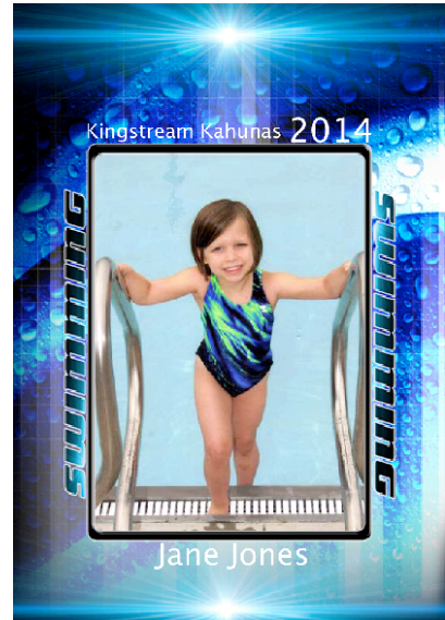
(2) 3.5x5 Magnets