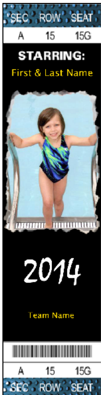
(5) Ticket Stubs