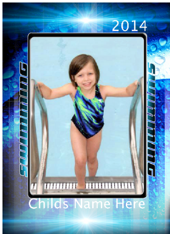
Trader Card Front