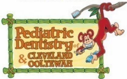
Pediatric Dentistry [edit]