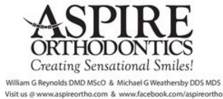
Aspire Orthodontics [edit]