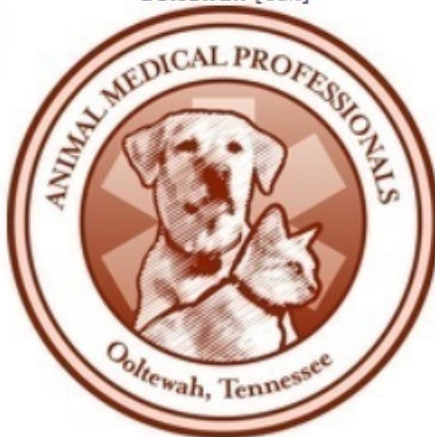
Animal Medical Professionals of Ooltewah [edit]