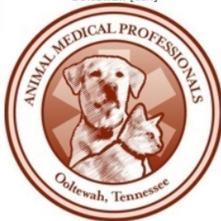
Animal Medical Professionals of Ooltewah [edit]