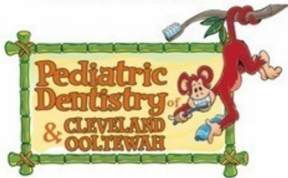
Pediatric Dentistry [edit]