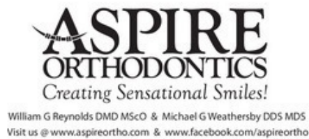
Aspire Orthodontics [edit]