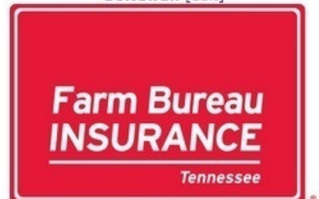
Farm Bureau Insurance of Ooltewah [edit]