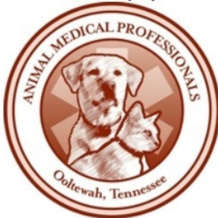
Animal Medical Professionals of Ooltewah [edit]