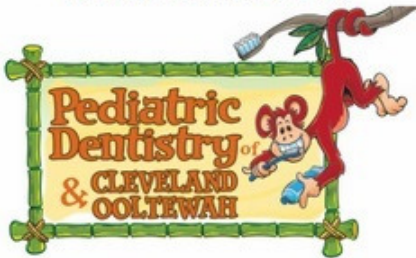
Pediatric Dentistry [edit]