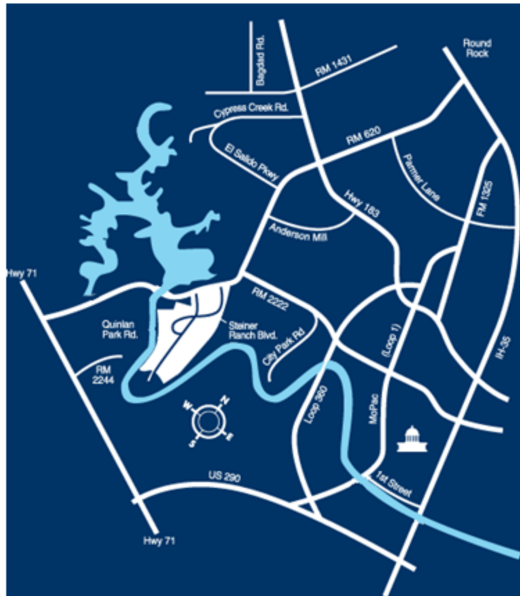
Steiner Ranch Subdivision (white area on map)